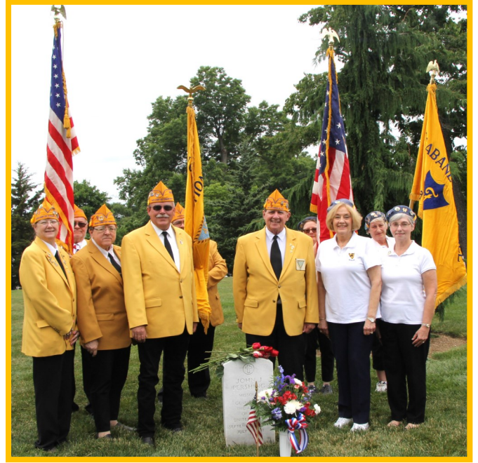
Pershing Grave Site