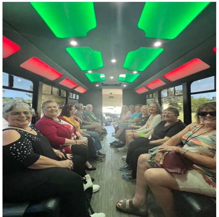
The Dames Winery Bus Tour