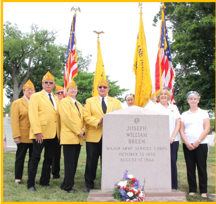
Breen Grave Site